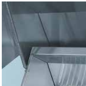
LYNX HOOD ASSIST

FOR MORE INFORMATION ON LYNX PROFESSIONAL PRODUCT FEATURES, PLEASE VISIT LYNXGRILLS.COM