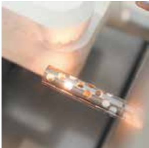
HOT SURFACE IGNITION