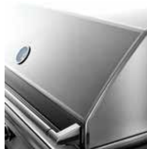
SEAMLESS WELDED CONSTRUCTION