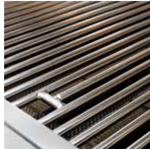
EXPANSIVE GRILLING SURFACE