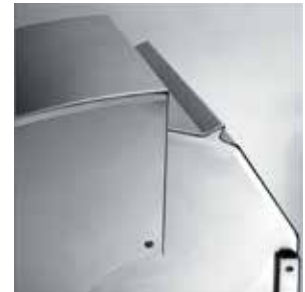
HEAT STABILIZING DESIGN