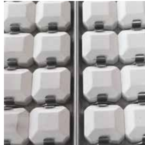
CERAMIC RADIANT BRIQUETTES